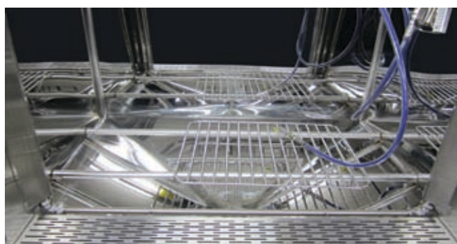
Component cleanliness measurement in a controlled stainless steel environment