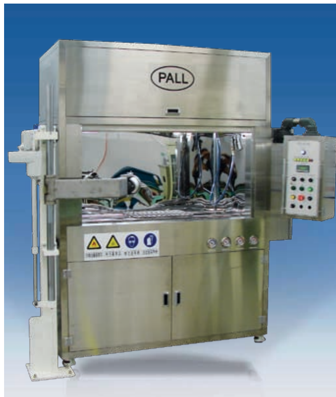
Pall PCC61-KC, Pall Cleanliness Cabinet