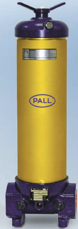
UR699 Series filter housing